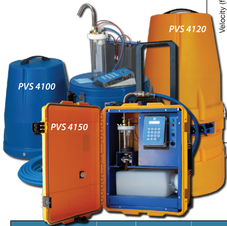
Pump Differences In Samplers: Velocity at Vertical Lift

SIRCO portable samplers come in a variety of models designed for variations in weight, pump strength, battery, larger intake hose (5/8" ID), ease-of-transport, fitting in manholes, discrete or composite sampling, and budgets.